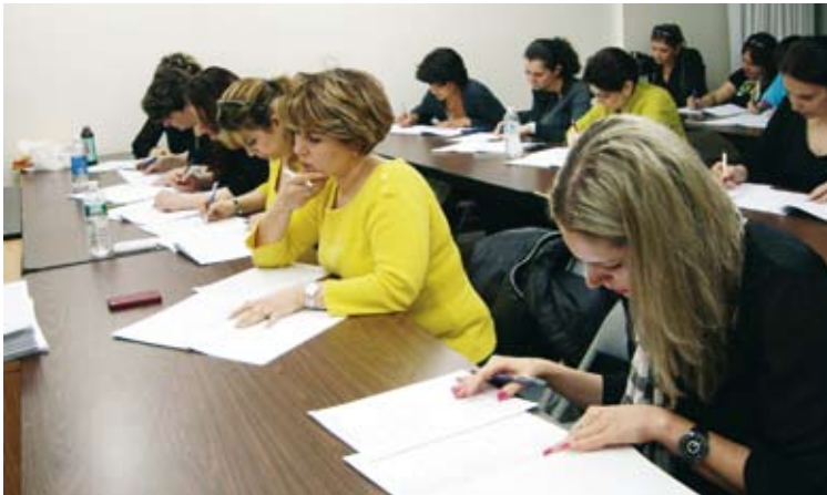
Dynamics of Total Enrolment of Students at Distance Nursing Programs

The MSN program provides nursing qualification for advanced practice or employment as a clinical leader or teacher.